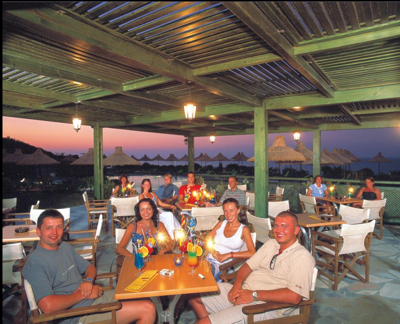
OPEN TERRACE BAR