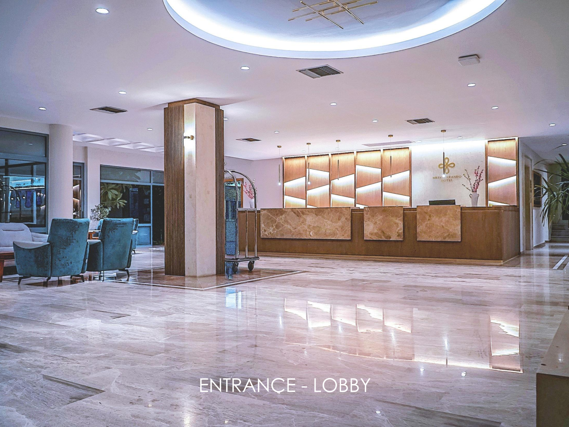
ENTRANCE - LOBBY